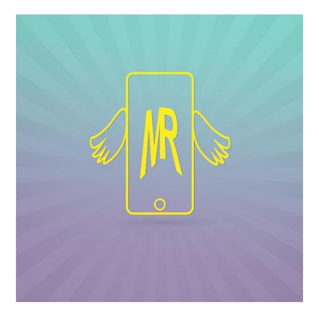
An Enablement Platform A better way to do on-line Collaboration, Distance Learning, TeleMedicine, TeleMeetup<sup>TM</sup> or TeleAnything<sup>TM</sup>

If you are a user of TeamViewer, Zoom, GoToMeeting, Webex etc. you would have occasions when you wished to do things in situ and be able to