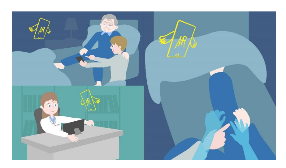
Note that you can do all that and more with/through MRESENCE

If you are householder or a guardian faced with a medical emergency in the middle of the night in a country where 911/EMS service is not readily available, you would wish that you could get medical advice when you desperately need it from medical professionals in other parts of the world who are doing their day-shift and are willing and able to help.